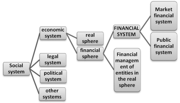
Fig. 1: The financial system as related to the social system (Pietrzak, 2008: 16).

The Polish solutions can be rightly expected to be similar to those developed in other countries, particularly that they do not have an innovative character. To find out whether it is really so, comparative studies and analyses are necessary. As mentioned earlier, a good point of reference for Poland is Spain. The impacts of the crisis of 2008 that hit hard the Spanish financial system are felt still today in the country. The crisis is described as financial so a question arises whether it was so severe that even the best-designed financial system would not have been able to cope with it, or whether the impacts of the crisis have been so painful for such a long time because of the country's financial system being the weakest link in the economy.