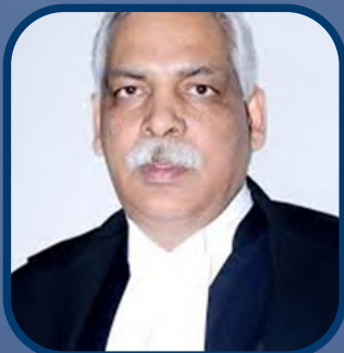
Hon'ble Mr. Justice D.K. Upadhyaya