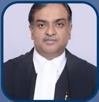
Hon'ble Mr. Justice Vikram Nath